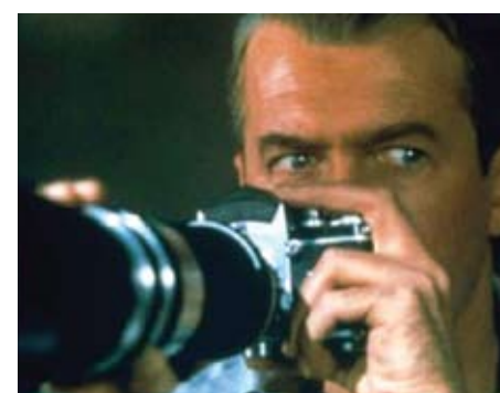
Still from Rear Window (1954)

Alfred Hitchcock was known to his audiences as the 'Master of Suspense' and what he mastered was not only the art of making films but also the task of taming his own raging imagination. Director of such works as Vertigo , Psycho , The Birds and The 39 steps , he told his stories through intelligent plots, witty dialogue and a spoonful of mystery & murder. In doing so, he inspired a new generation of filmmakers and revolutionized the thriller genre, making him a legend around the world.