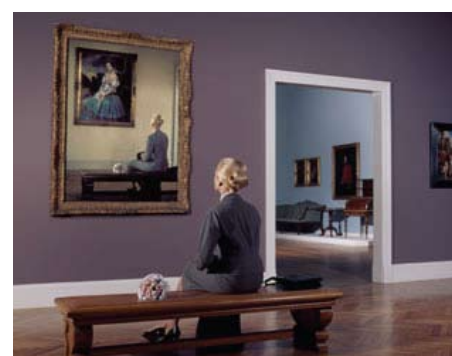
Still from the 'dream sequence' in Vertigo (1958)