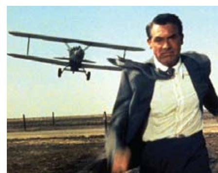
Still from North by Northwest (1959)

His father died when Hitchcock was only 14 years old. He had to quit school, but continued to study and read on his own. He took evening classes, attended theater and cinema performances regularly, and he got his feet wet in the talent pool of art & writing. In 1920, he worked with an American film as a title designer, and developed love for the art of film making from there. He was determined to learn the in & out's of the film industry, which led him to become a Director just 5 years after his entry into the business.