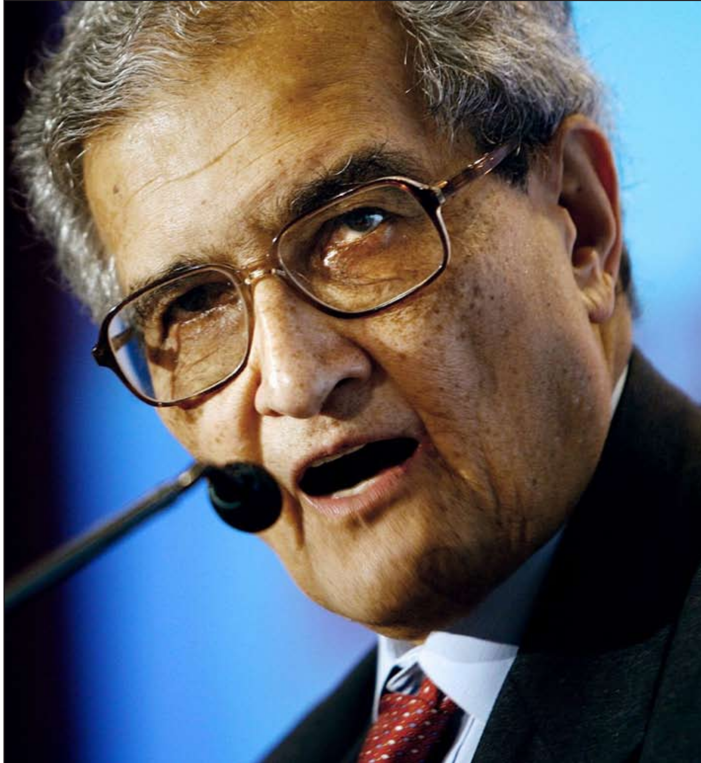
DR. AMARTYA SEN

“The idea that I should be a teacher and a researcher of some sort did not vary over the years”