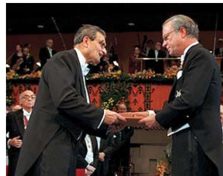
Receiving the Nobel Prize