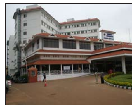
Narayana Hrudayalaya Bangalore