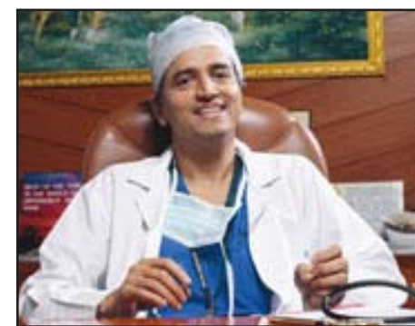
A man with a Mission

A philanthropist and a renowned cardiac surgeon, Dr Devi Prasad Shetty has earned fame across India and the world. His achievements include being the first heart surgeon in India to perform neo-natal open-heart surgery, first surgeon in India to use an artificial heart and many others. Dr. Shetty has brought down the cost of many complicated heart surgeries, bringing them within the reach of the common people.