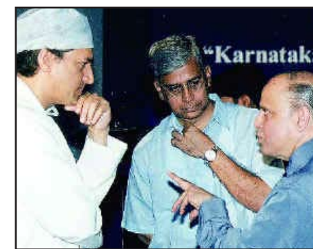
During the launch of Karnataka's first telemedicine project

Narayana Hrudayalaya , a multi-speciality hospital in the outskirts of Bangalore founded by Dr. Shetty, is flocked by patients from near and far because of the high quality and affordable treatment provided. Dr Shetty is also credited with introducing Yashvini, a health insurance scheme provided at very normal rates in collaboration with the Karnataka Government. He is well known for operating children below the age of 12, for free.