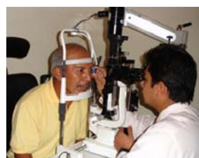
A man undergoes a test at an Arvind Centre