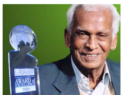
Felicitated with many honours

Dr Govindappa Venkataswamy , affectionately known as “Dr V.” among his patients, was a legendary eye surgeon from Southern India who influenced many he met, and millions he never knew. Dr Venkataswamy had personally supervised more than one hundred thousand cataract operations. Upon retiring from Government service in 1976, he established the Aravind Eye Care Hospital which is today the largest Eye Care Training and Research Centre in the world. He also developed and pioneered the concept of eye camps and safe assembly-line techniques, which have become models for blindness preventions and treatment programs worldwide.