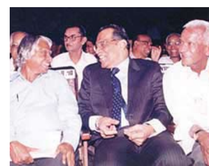
with APJ Abdul Kalam during Silver Jubilee Celebration of Aravind